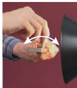
Figure 3. Visual inspection of scraper

If light is visible, the scraper is not suitable for use and should be replaced - see “Spares” on page 10.